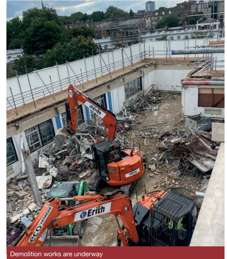
Demolition works are underway

Safety remains our top priority. The auditors noted our numerous safety and emergency measures implemented throughout the site. We also promote healthy living through mental health awareness initiatives and are proud to have a mental health first aider on-site to support our team.