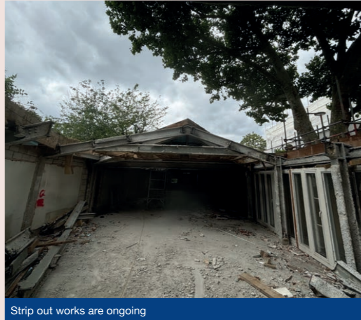
Strip out works are ongoing

We are committed to strong environmental practices. Our environmental measures are actively promoted during workforce induction. Carbon footprint reporting and reduction strategies are in place, and we are continuously looking for ways to improve. Safety is a key focus, with effective safety measures implemented with active workforce involvement. We also promote healthy living and mental health awareness on-site, and our site manager will soon attend a mental health first aid training course to further support our team.