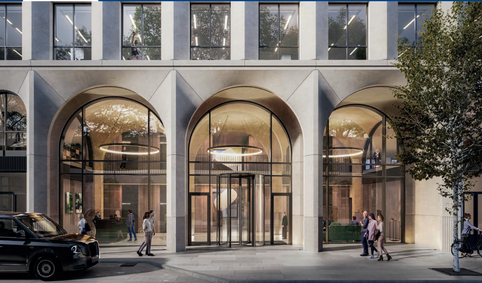
80 Pelham Street entrance