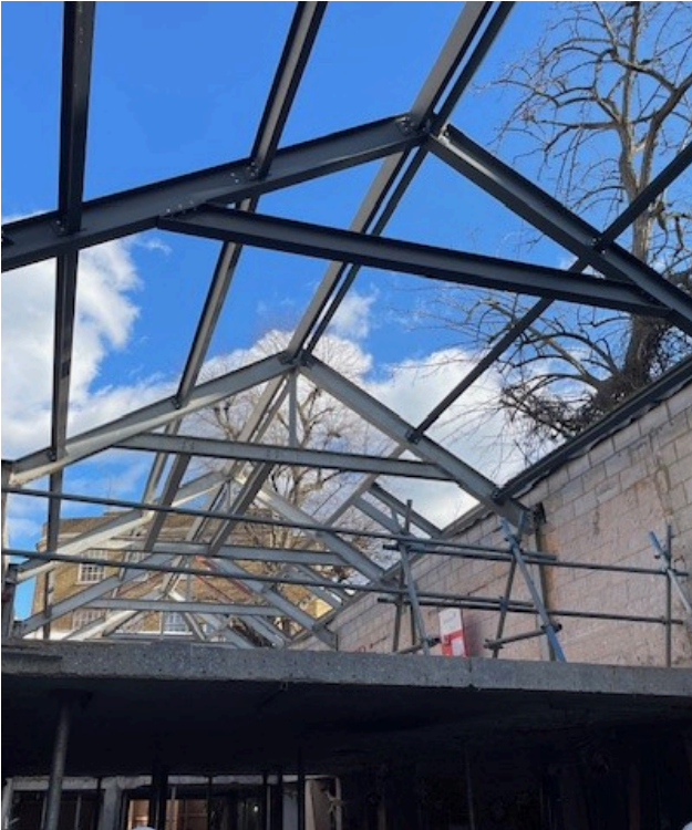
Work to install the roof on the new eastern building is now underway

Danny Magnus Neilcott Construction Email: dmagnus@neilcott.co.uk Phone: 07957 126325