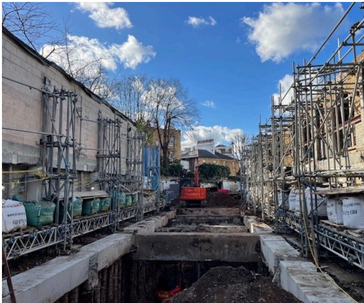
Work to lower the basement in the western building is almost complete