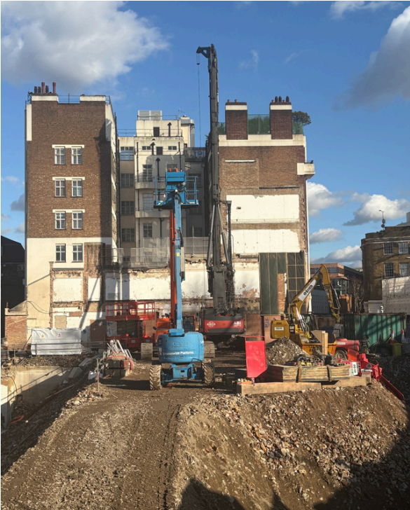
The main piling work is now underway

For questions about the works, please contact