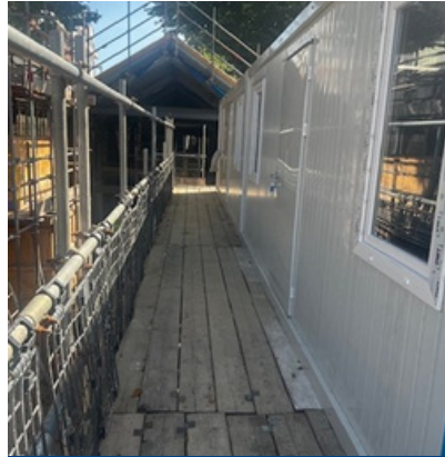
New site offices set up in the courtyard

Danny Magnus Neilcott Construction Email: dmagnus@neilcott.co.uk Phone: 07957 126325