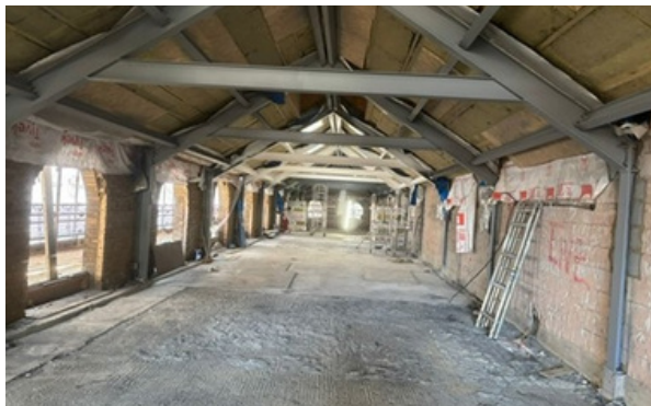
Interior shot of the refurbished building and new roof

From Monday 8 th September , the footpath outside 40 Pelham Street will be closed from Monday morning to Friday evening until mid-December. The closure is necessary to enable the team to safely restore the historic brickwork and install new windows. An alternative pedestrian walkway will be set up in the pitlane in front of the site, along the Pelham Street façade, which is clearly signposted. Thank you for bearing with us.