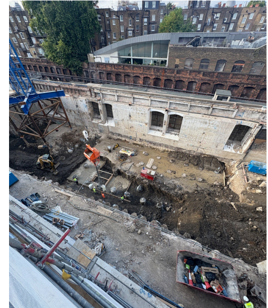
The new basement slab is about to be poured