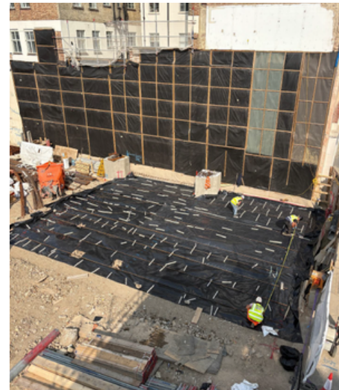
Exterior shot of the logistics slab being laid