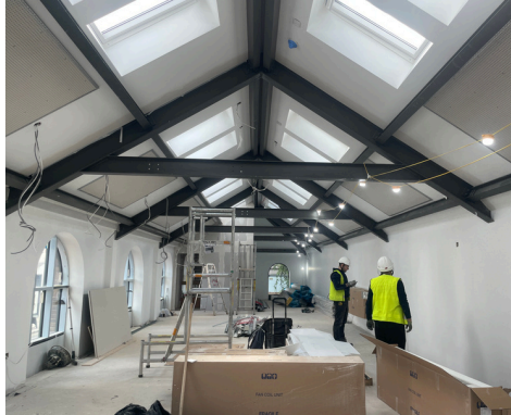
Internal view of the refurbished building

McAleer and Rushe is a family-run construction company with almost 60 years of experience, delivering projects across the UK with a strong focus on London. They have extensive experience working in constrained urban environments, managing complex construction activity safely while limiting impact on surrounding communities.